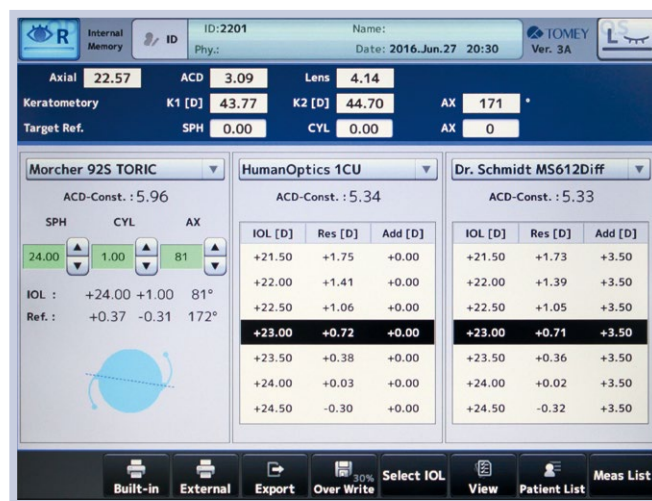
Easy IOL – a new way of ray tracing