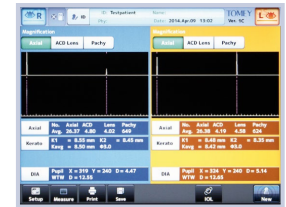
Measurement screen dual view

A video says more than a thousand words – just scan this QR-Code.