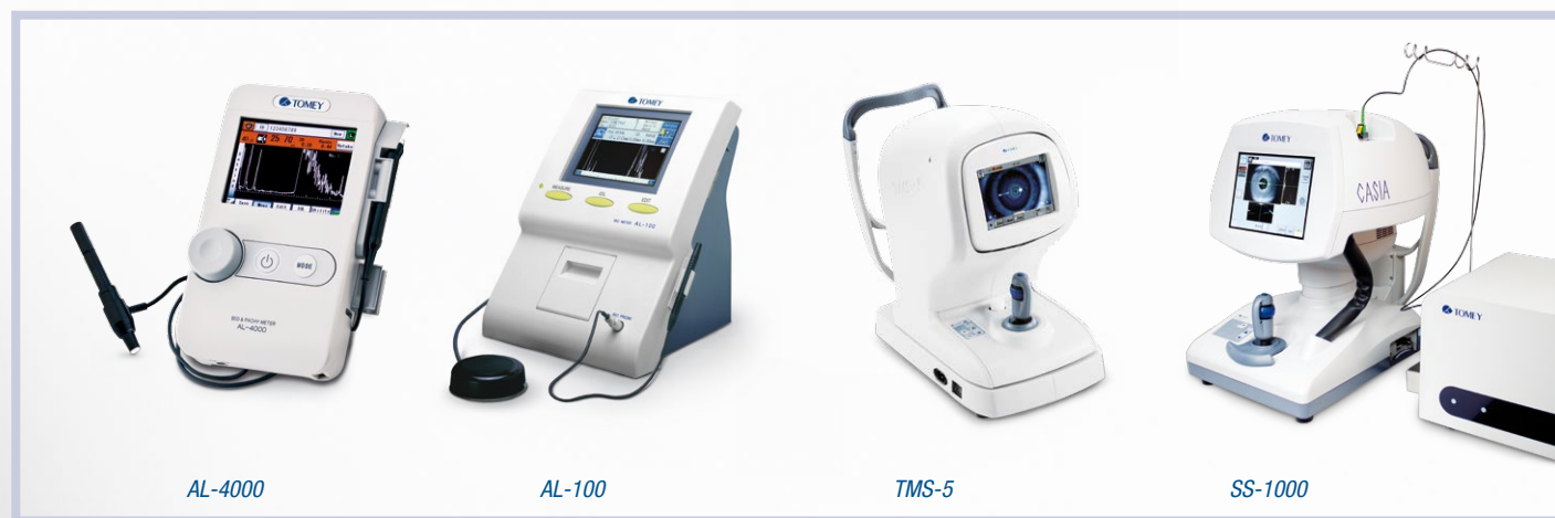
OA-2000 communicates with OCT SS-1000, Bio-/Pachymeter AL-4000, A-scan/Biometer AL-100 and Scheimpflug TMS-5.

2017/08 - subject to change without notice